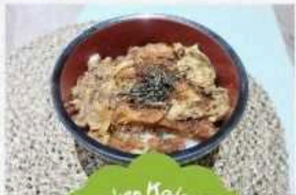
Chicken Katsu Don

All price are inclusive of tax and service