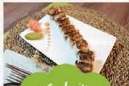
Unagi Godzilla Roll