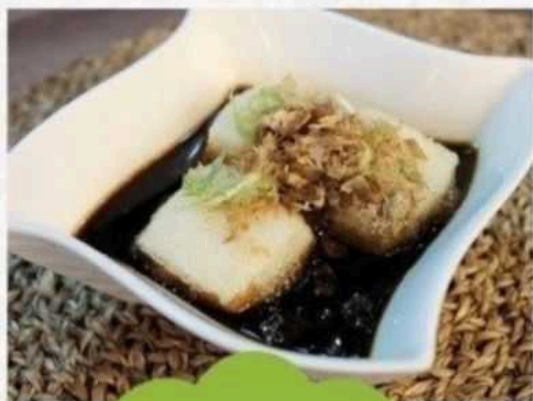
Age Dashi Tofu