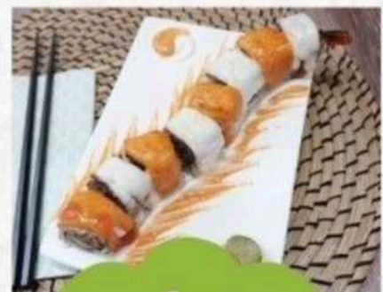
Yasami Special Roll

(Sauteed Beef with Yakiniku Sauce, Tempura Flakes, Kyuri, topped with Sesame & Togarashi)