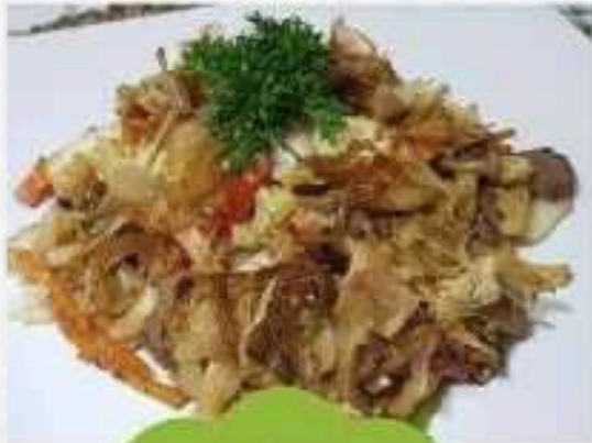
Yaki Udon Beef