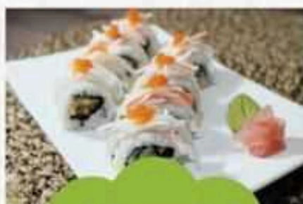
Crab Crunchy Roll