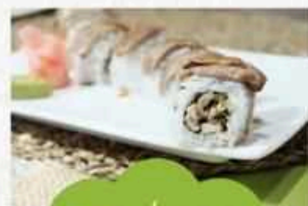
Beef Mushroom Roll