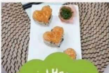
Special Heart Roll

(Kani Stick, Mayonnaise, Garlic Powder, Sesame, topped with Spicy Mayonnaise)