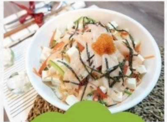
Yasami Special Salad