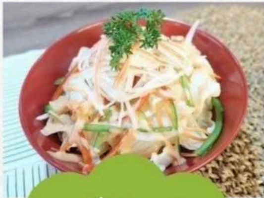
Kani Mayo Salad