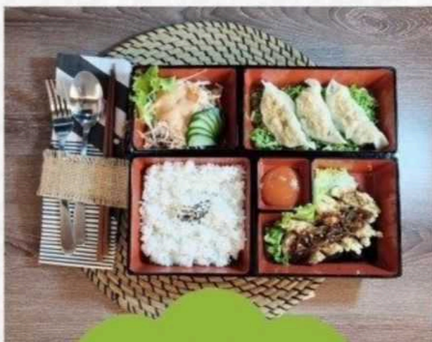
Yasami Chioza Bento

(Shrimp Katsu served with Rice & Curry Sauce)